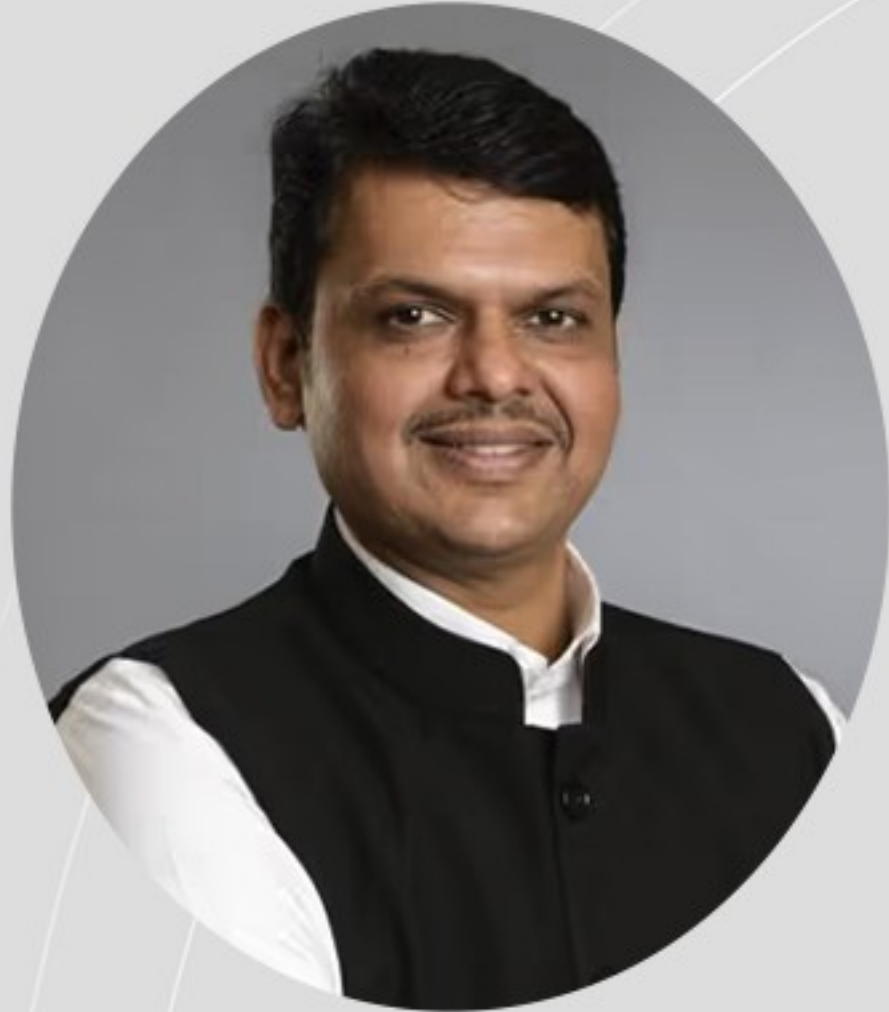
Shri. Devendraji Fadnavis Hon. Chief Minister of Maharashtra